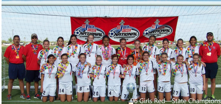
96 Girls Red—State Champions

"These types of accomplishments reflect years and years of training, commitment, sacrifice, memories, and countless individuals making contributions over the years. We now have just a few weeks to prepare for what will be one of the most memorable experiences of these girls' lives. We will do our best to represent our state well, on, and off the field, and make Arizona proud."