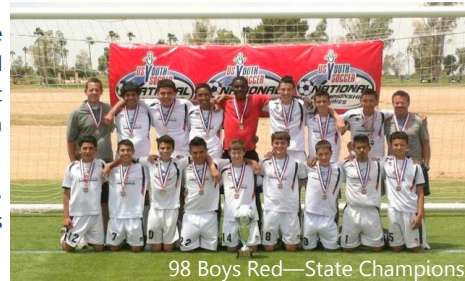
98 Boys Red—State Champions