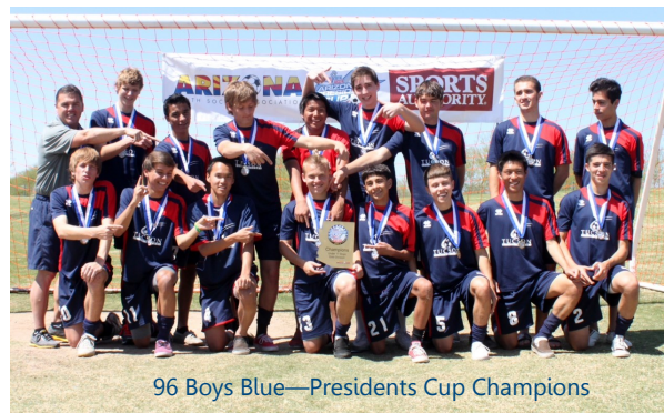
96 Boys Blue—Presidents Cup Champions